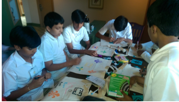
Group 3 Boys Painting Their Reusable Canvas Bags

To many, this weekend felt like we were verily in Trayee Brindavan in Swami's immediate presence attending a Summer Course. The memories of basking in His love, and soaking in the character building lessons imparted via the various activities would stay with all for a long time to come.