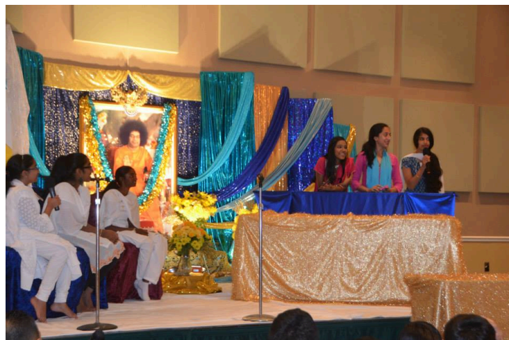
Group 3 children enacting a TV Talk Show on "Respect"

The evening was wrapped up with a wonderful service project also centered around respecting nature. Each child painted their own reusable canvas bag that they intend to use for the weekly SSE classes.