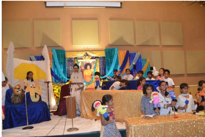
Group 1 and 2 children enacting a Puppet Show

own life. The puppet show by the Group 1 children was the icing on the cake. It was well crafted and executed by the children and kept the audience regaling with laughter at the same time imparting beautiful lessons.