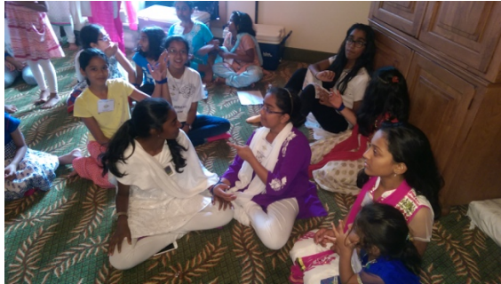
The children enjoying the Unity Games

The children were paired up and their wrists were tied together. Using only the free hands, the children had to execute a number of tasks such as blowing a balloon and tying it, throwing a ball and catching it with a cup, and unwrapping candies. Despite the difficulty of the tasks, the children accomplished it with elan due to their spirit of unity and team work.