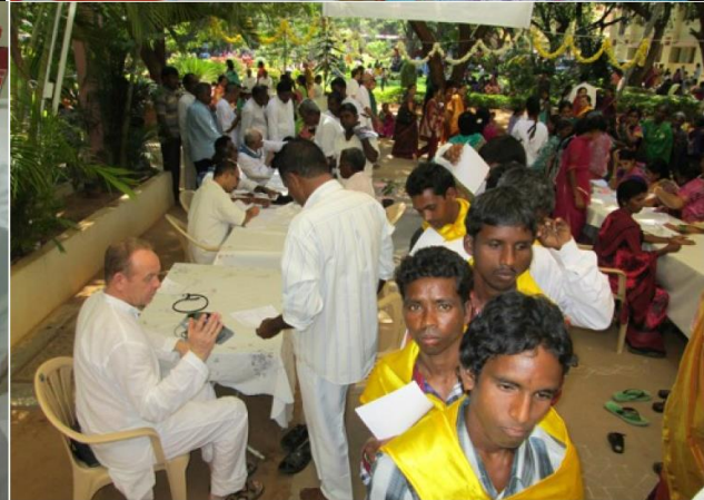
During November 2014 Birthday Medical Camp