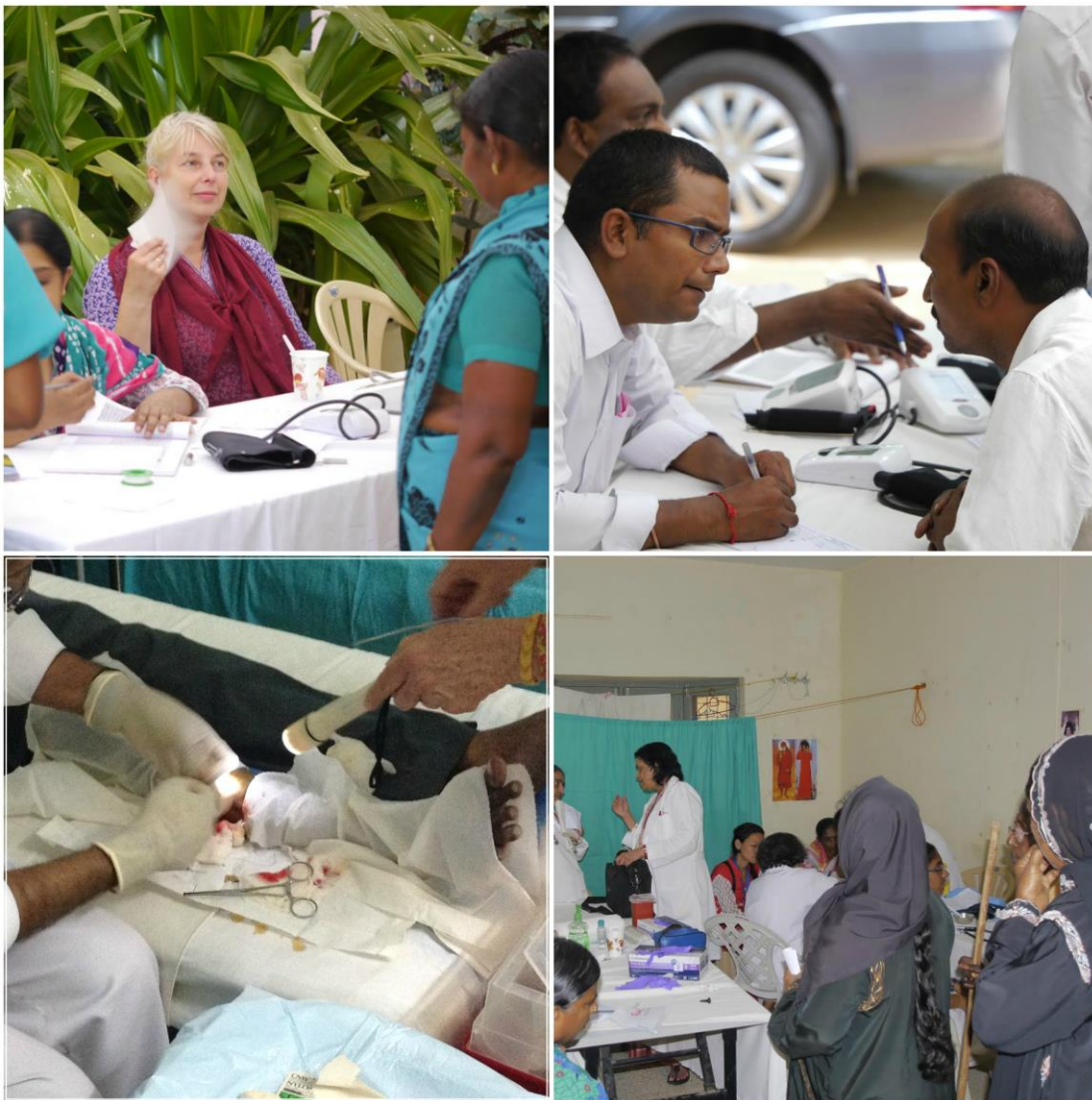
Glimpses of the Medical team during July 2015

Acute care services such as inhalation pulmonary treatments, wound care and Intravenous fluids and antibiotics administration are part of these camps in addition to medical management of acute and chronic medical issues. Additionally, health education is provided. Patients who need acute care are transferred to either the Sri Sathya Sai General Hospital or the Sri Sathya Sai Institute of Higher Medical Sciences (Super Specialty Hospital), Prasanthigram for further diagnosis and treatment.